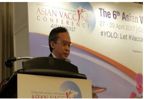
A DENGUE WHITE PAPER For the WORLD!