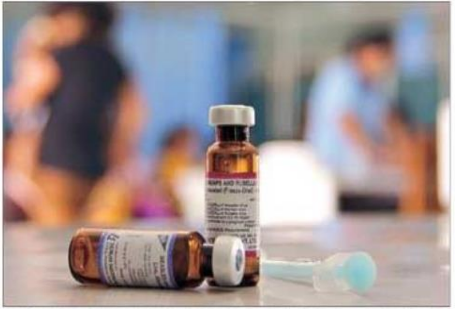
Vaccines are pictured next to patients in a hospital in Sarangani province in this November 2018 photo. At least 20 people have reportedly died of 'tigdas' or German measles in the province.